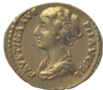
1 Gold coin with portrait of Faustina the Younger (wife of Marcus Aurelius), 2nd century AD

The life of Marcus Aurelius was marked by contrasts: while his long years as heir to the throne were largely peaceful, his reign as emperor was marked by bitter conflicts and campaigns. Above all, however, his love of philosophy and his "Meditations" make him the exception of antiquity and distinguish him from other rulers of his time. In the Landesmuseum, several hundred valuable top exhibits from numerous European museums illustrate the stages of the life of Marcus Aurelius and bring the time of his reign to life.