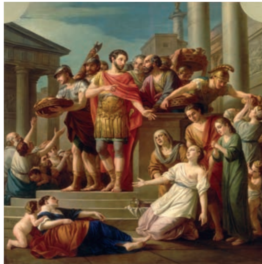
4 Painting by Joseph Marie Vien, Marc Aurèle secourant le peuple, 1765