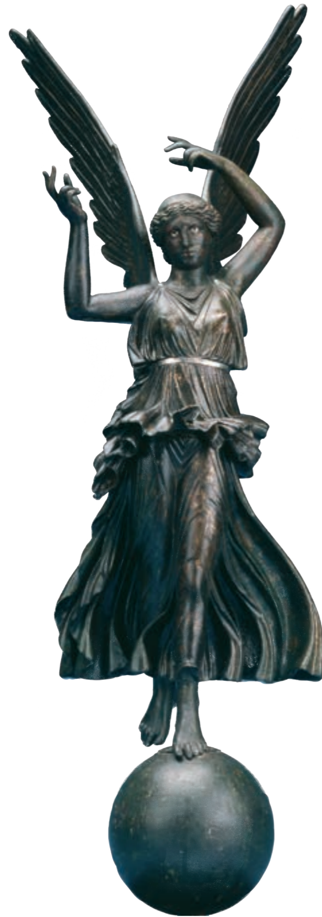
2 Victoria von Fossombrone, 2nd century AD